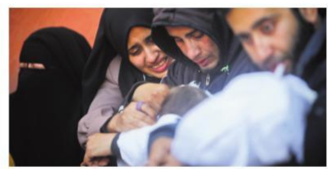
Palestinians mourn for relatives killed in the Israeli bombardment of the Gaza Strip outside a morgue in Khan Younis on Sunday

About confidence in winning, she said, "InshaAllah, we will win the election...we will form the government. No doubt about it. We have faith and confidence in people that they will vote for Boat (her election symbol)."