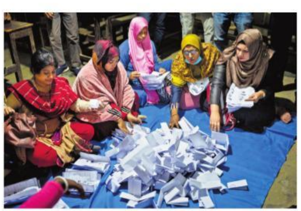
Bangladeshi polling officials count votes after the voting ended at a polling station in Munshiganj, outside Dhaka in Bangladesh on Sunday

Two persons were taken to Chattogram Medical College Hospital after they were shot during a clash between supporters of two candidates run-