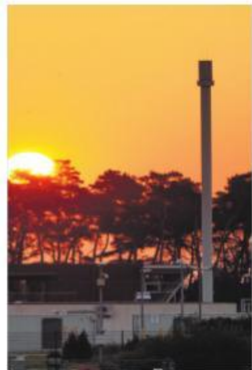
great power we gave it to blackmail Europe and Germany," Habeck of the ecologist Green party told reporters.

Enduring German reliance on Russian gas coupled with alarming signals from Moscow have turned up the pressure on Europe's top economy.