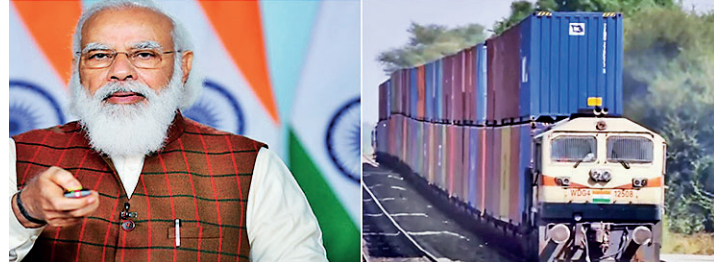
PM Narendra Modi inaugurates the New Khurja-New Bhaupur section of Eastern Dedicated Freight Corridor via video conferencing Tuesday