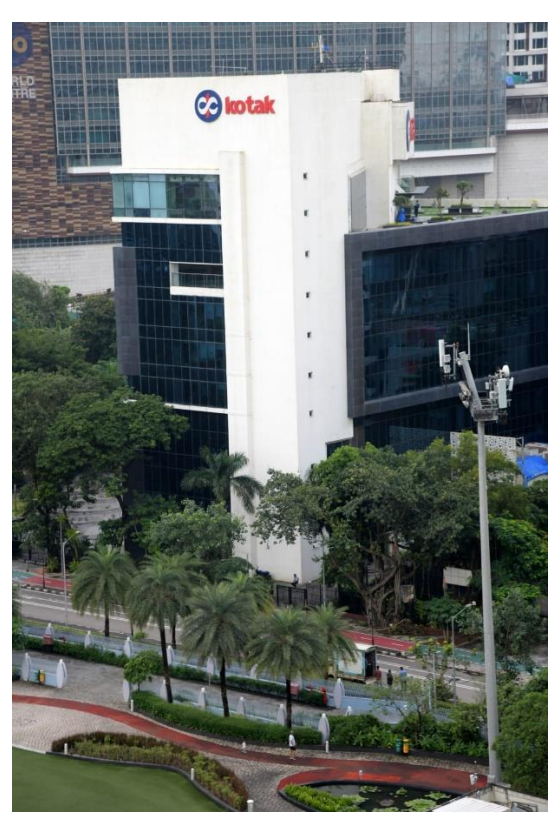
Kotak Group Current Headquarters at 27 BKC