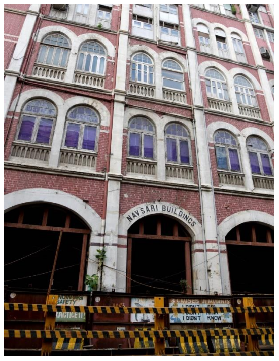
Navsari Building at Victoria Terminus where the group commenced operations