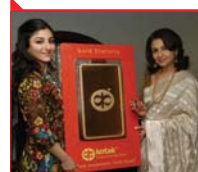
Bank launched 'Gold Eternity' - Gold bars in 50gms and 100gms