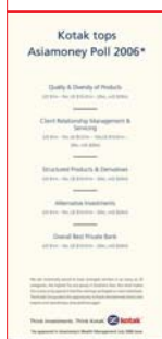
Kotak tops Asia Money Poll 2006