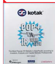
Awarded Most Popular Investor Relation Website for the Asia/Pacific Region by IR Global rankings 2007