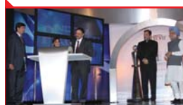
Best Mutual Fund House in the NDTV Business Leadership Award 2006