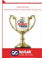
Kotak Securities awarded Best Broker in India for 2006 by Asiamoney