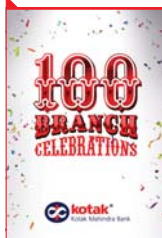
100 bank branches in just 4 years