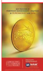
Best Provider of Portfolio Management - Equities by Euromoney in 2006