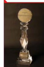
Bank awarded IT Team of the Year at the Annual Banking Technology Awards 2006